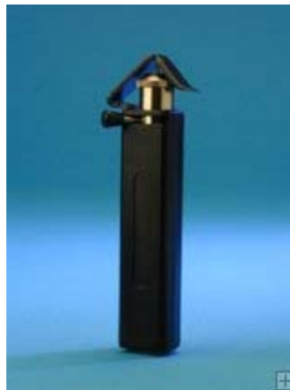
Round Cable Stripper

Die for Barrel Type Connectors 22-12 AWG Non Insulated