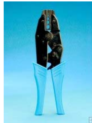
Crimping Tool Frame Only