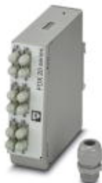
DIN rail splice box, fully mounted ready to splice, for 6x ST duplex (OM2)

Please be informed that the data shown in this PDF Document is generated from our Online Catalog. Please find the complete data in the user's documentation. Our General Terms of Use for Downloads are valid ( http://phoenixcontact.com/download )