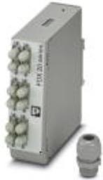
DIN rail splice box, fully mounted ready to splice, for 6x ST duplex (OM1)

Please be informed that the data shown in this PDF Document is generated from our Online Catalog. Please find the complete data in the user's documentation. Our General Terms of Use for Downloads are valid ( http://phoenixcontact.com/download )