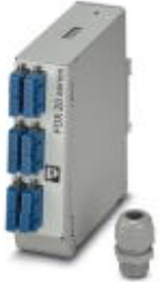
DIN rail splice box, fully mounted ready to splice, for 6x SC duplex (OS2)

Please be informed that the data shown in this PDF Document is generated from our Online Catalog. Please find the complete data in the user's documentation. Our General Terms of Use for Downloads are valid ( http://phoenixcontact.com/download )