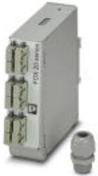
DIN rail splice box, fully mounted ready to splice, for 6x SC duplex (OM4)

Please be informed that the data shown in this PDF Document is generated from our Online Catalog. Please find the complete data in the user's documentation. Our General Terms of Use for Downloads are valid ( http://phoenixcontact.com/download )