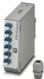
DIN rail splice box, fully mounted ready to splice, for 6x LC duplex (OS2)

Please be informed that the data shown in this PDF Document is generated from our Online Catalog. Please find the complete data in the user's documentation. Our General Terms of Use for Downloads are valid ( http://phoenixcontact.com/download )