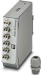
DIN rail splice box, fully mounted ready to splice, for 6x LC duplex (OM4)

Please be informed that the data shown in this PDF Document is generated from our Online Catalog. Please find the complete data in the user's documentation. Our General Terms of Use for Downloads are valid ( http://phoenixcontact.com/download )