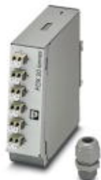
DIN rail splice box, fully mounted ready to splice, for 6x LC duplex (OM2)

Please be informed that the data shown in this PDF Document is generated from our Online Catalog. Please find the complete data in the user's documentation. Our General Terms of Use for Downloads are valid ( http://phoenixcontact.com/download )