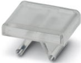
The figure shows a similar product

4-chamber marker carriers, can be optionally labeled with insert strips ES... or 4 snap-in profiles EPB