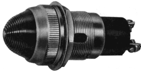
103-3101-0531-403 Torpedo lens

For materials and finishes of products in this group, see preceding page.