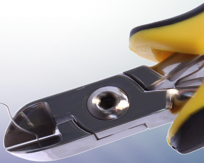
Tungsten Carbide Blades 79-80 HRC

Aven's Tungsten Carbide Oval Head Cutters are designed to cut through hard wires with ease. The tungsten carbide blades have a hardness rating of 79-80 HRC for exceptional durability. Applications include Guide Wires, Stents, Catheters and Single/Multiple Fillers. Available with Flush and Semi-Flush blades.