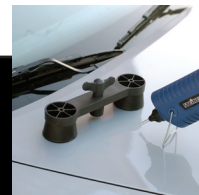
Paintless Dent Removal