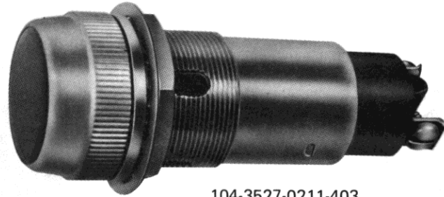
104-3527-0211-403 Flat lens

Recognized under the component program of Underwriters' Laboratories Inc.