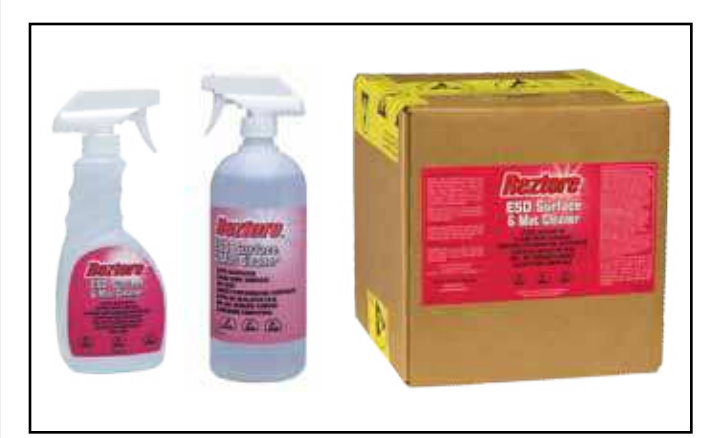
Figure 1. Reztore™ Surface & Mat Cleaner: 16 ounce (500 ml) spray bottle 1 quart (1 litre) spray bottle 2.5 Gallon (10 litre) Bag-in-Box