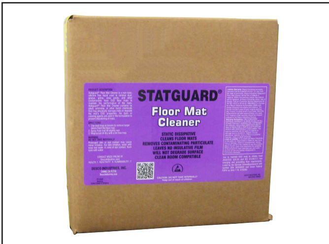
Figure 2. 2.5 Gallon Bag-in-Box ( 10444 )