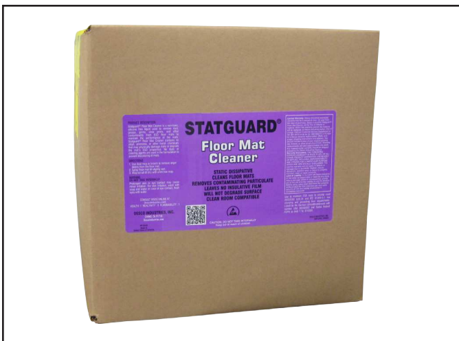
Figure 3. 5 Gallon Bag-in-Box ( 10445 )