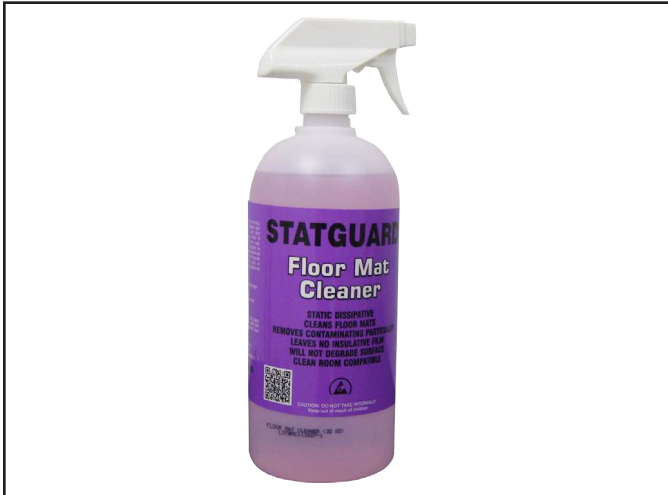
Figure 1. 1 Quart Spray Bottle ( 10443 )