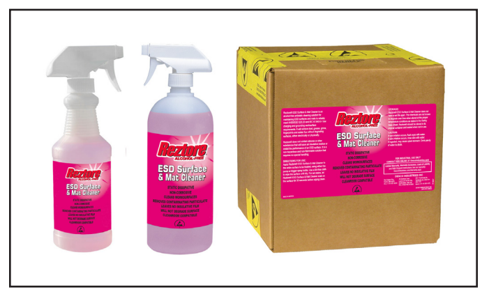
Figure 1. Reztore® Alcohol-Free ESD Surface & Mat Cleaner: 16 Ounces (500 mL) Spray Bottle 1 Quart (1 liter) Spray Bottle 2.5 Gallons (10 liters) Bag-in-Box