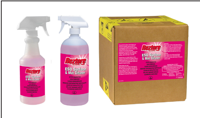
Figure 1. Reztore® Alcohol-Free ESD Surface & Mat Cleaner: 16 Ounces (500 mL) Spray Bottle 1 Quart (1 liter) Spray Bottle 2.5 Gallons (10 liters) Bag-in-Box