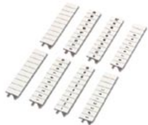
Zack marker strip, 10-section, horizontally labeled with the identical number: 5, white, width: 5 mm

Please be informed that the data shown in this PDF Document is generated from our Online Catalog. Please find the complete data in the user's documentation. Our General Terms of Use for Downloads are valid ( http://phoenixcontact.com/download )