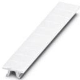
Zack marker strip, 10-section, vertically labeled with the consecutive numbers: 11 ... 20, white, width: 6 mm

Please be informed that the data shown in this PDF Document is generated from our Online Catalog. Please find the complete data in the user's documentation. Our General Terms of Use for Downloads are valid ( http://phoenixcontact.com/download )