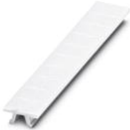
Zack marker strip, 10-section, vertically labeled with the consecutive numbers: 161 ... 170, white, width: 6 mm

Please be informed that the data shown in this PDF Document is generated from our Online Catalog. Please find the complete data in the user's documentation. Our General Terms of Use for Downloads are valid ( http://phoenixcontact.com/download )