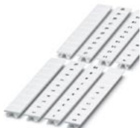
Zack marker strip, 10-section, horizontally labeled with the consecutive numbers: 31 ... 40, white, width: 8 mm

Please be informed that the data shown in this PDF Document is generated from our Online Catalog. Please find the complete data in the user's documentation. Our General Terms of Use for Downloads are valid ( http://phoenixcontact.com/download )