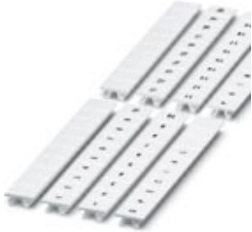
Zack marker strip, 10-section, horizontally labeled with the consecutive numbers: 41 ... 50, white, width: 8 mm

Please be informed that the data shown in this PDF Document is generated from our Online Catalog. Please find the complete data in the user's documentation. Our General Terms of Use for Downloads are valid ( http://phoenixcontact.com/download )