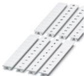
Zack marker strip, 10-section, horizontally labeled with the consecutive numbers: 81 ... 90, white, width: 8 mm

Please be informed that the data shown in this PDF Document is generated from our Online Catalog. Please find the complete data in the user's documentation. Our General Terms of Use for Downloads are valid ( http://phoenixcontact.com/download )