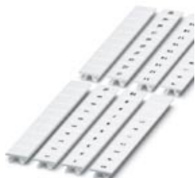
Zack marker strip, 10-section, horizontally labeled with the consecutive numbers: 151 ... 160, white, width: 8 mm

Please be informed that the data shown in this PDF Document is generated from our Online Catalog. Please find the complete data in the user's documentation. Our General Terms of Use for Downloads are valid ( http://phoenixcontact.com/download )