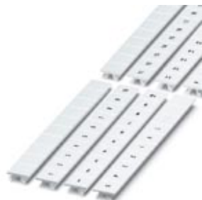
Zack marker strip, 10-section, horizontally labeled with the consecutive numbers: 121 ... 130, white

Please be informed that the data shown in this PDF Document is generated from our Online Catalog. Please find the complete data in the user's documentation. Our General Terms of Use for Downloads are valid ( http://phoenixcontact.com/download )