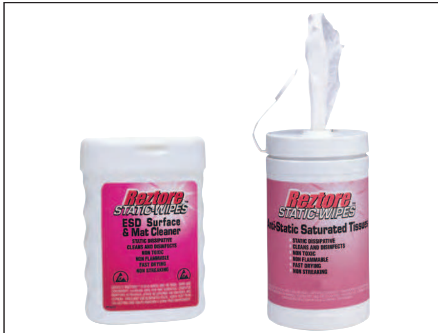
Figure 1. Reztore™ Static-Wipes: 60 Wipes in an Anti-Static Canister 160 Wipes in an Anti-Static Canister