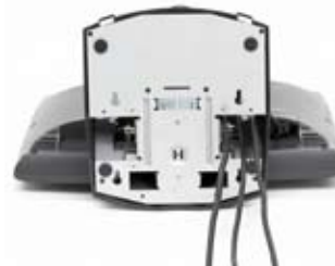
"Cable-Through-Bottom" routing option for seamless counter or wall installation