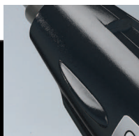
Molded Safety Rests