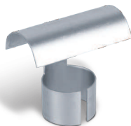
40 mm Large Reflector