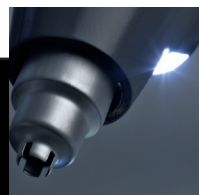
Integrated LED Light Provides Bright Illumination