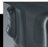
Toggle Switch 0 Off / 1 Cool / 2 Heat