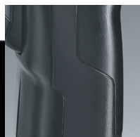
Soft Grip Handle