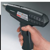
Optimized Weight Balance for Fatigue-Free Operation