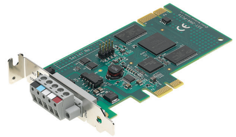
DN4 DeviceNet PCIe Card Series 112113