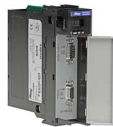
Communication Module 112016-0018 (SST-PB3-CLX-RLL)