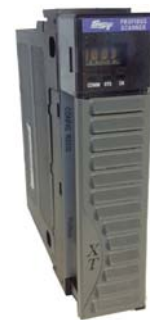
CLXT Communication Module 112016-0024 (SST-PB3-CLXT-RLL)