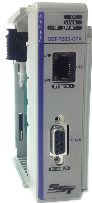
SST™-PB3S-CPX PROFIBUS* Slave Module