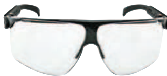
3M™ Maxim™ w/RAS

RAS (rugged anti-scratch coating) – for tough environments that require extremely scratch-resistant lenses.