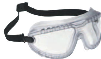
3M™ Lexa™ Splash GoggleGear™

Lightweight, low-profile splash goggle with adjustable lens angle.