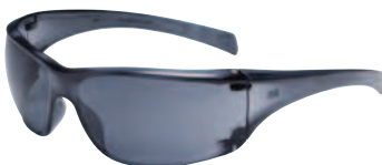
3M™ Virtua™ AP

Graceful unisex styling and integral sideshields.