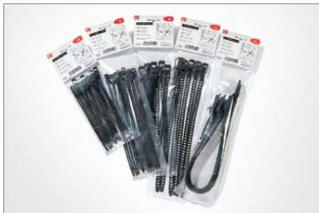
SOFTFIX ties available in small packaging units.