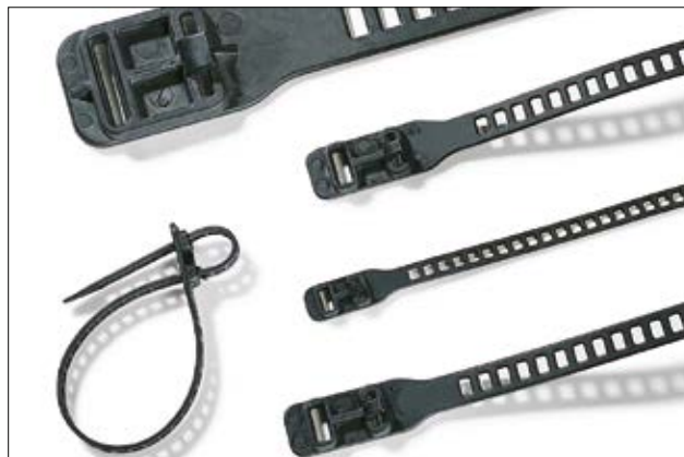
The elasticity of the SOFTIX ties makes them suitable for use in many applications.