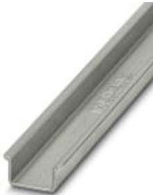
DIN rail, material: Steel, unperforated, height 15 mm, width 35 mm, length: 2 m

Please be informed that the data shown in this PDF Document is generated from our Online Catalog. Please find the complete data in the user's documentation. Our General Terms of Use for Downloads are valid ( http://download.phoenixcontact.com )