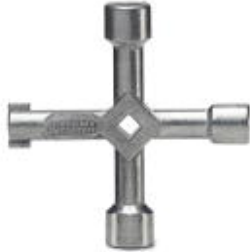
Control cabinet key, metal, for all common types of control cabinet

Please be informed that the data shown in this PDF Document is generated from our Online Catalog. Please find the complete data in the user's documentation. Our General Terms of Use for Downloads are valid ( http://download.phoenixcontact.com )