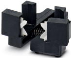
Replacement knife for the automatic stripping and crimping device CF 3000-2,5

Please be informed that the data shown in this PDF Document is generated from our Online Catalog. Please find the complete data in the user's documentation. Our General Terms of Use for Downloads are valid ( http://download.phoenixcontact.com )