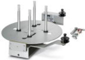
Cable roller for CUTFOX 10

Please be informed that the data shown in this PDF Document is generated from our Online Catalog. Please find the complete data in the user's documentation. Our General Terms of Use for Downloads are valid ( http://phoenixcontact.com/download )