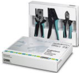
Tool set, equipped

Please be informed that the data shown in this PDF Document is generated from our Online Catalog. Please find the complete data in the user's documentation. Our General Terms of Use for Downloads are valid ( http://download.phoenixcontact.com )