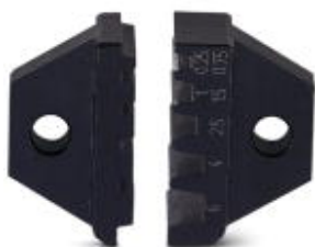
Spare die for CRIMPFOX 6

Please be informed that the data shown in this PDF Document is generated from our Online Catalog. Please find the complete data in the user's documentation. Our General Terms of Use for Downloads are valid ( http://phoenixcontact.com/download )