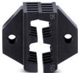
Spare die, for CRIMPFOX 50R

Please be informed that the data shown in this PDF Document is generated from our Online Catalog. Please find the complete data in the user's documentation. Our General Terms of Use for Downloads are valid ( http://download.phoenixcontact.com )