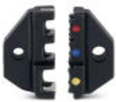
Spare die for CRIMPFOX-RCI 6

Replacement die - CRIMPFOX-RCI 6/DIE - 1212058