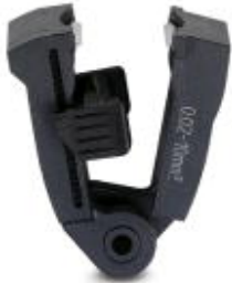
Replacement blade for WIREFOX 10, for cables and conductors of 0.02 - 10 mm 2

Please be informed that the data shown in this PDF Document is generated from our Online Catalog. Please find the complete data in the user's documentation. Our General Terms of Use for Downloads are valid ( http://phoenixcontact.com/download )