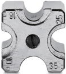
Die (lower part), for CRIMPFOX-C120, for non-insulated cable lugs (DIN 46234) 10 + 16 + 25 + 35 mm 2 , indent crimp

Please be informed that the data shown in this PDF Document is generated from our Online Catalog. Please find the complete data in the user's documentation. Our General Terms of Use for Downloads are valid ( http://download.phoenixcontact.com )