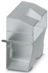
Waste holder for stripping machine

Please be informed that the data shown in this PDF Document is generated from our Online Catalog. Please find the complete data in the user's documentation. Our General Terms of Use for Downloads are valid ( http://phoenixcontact.com/download )