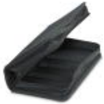
Tool box, empty

Tool bag - TOOL-KIT STANDARD EMPTY - 1212423