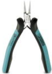
Electronic round-nose pliers, smooth grip, with opening spring

Please be informed that the data shown in this PDF Document is generated from our Online Catalog. Please find the complete data in the user's documentation. Our General Terms of Use for Downloads are valid ( http://download.phoenixcontact.com )