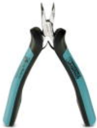
Electronic needle-nose pliers, 45° angle, smooth grip, with opening spring

Please be informed that the data shown in this PDF Document is generated from our Online Catalog. Please find the complete data in the user's documentation. Our General Terms of Use for Downloads are valid ( http://download.phoenixcontact.com )