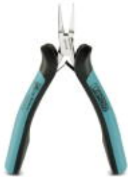
Electronic flat pliers, smooth gripping surface, with spring opening

Please be informed that the data shown in this PDF Document is generated from our Online Catalog. Please find the complete data in the user's documentation. Our General Terms of Use for Downloads are valid ( http://download.phoenixcontact.com )