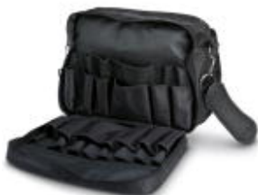
Tool bag, with document and laptop compartments, unequipped

Please be informed that the data shown in this PDF Document is generated from our Online Catalog. Please find the complete data in the user's documentation. Our General Terms of Use for Downloads are valid ( http://phoenixcontact.com/download )