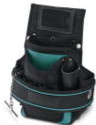
Tool waist bag, unequipped

Please be informed that the data shown in this PDF Document is generated from our Online Catalog. Please find the complete data in the user's documentation. Our General Terms of Use for Downloads are valid ( http://phoenixcontact.com/download )